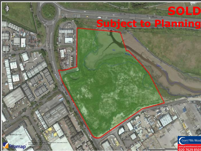
Anthony's Way, Frindsbury, Rochester, Kent, ME2 4DW 12.58 Acre Site for Retail