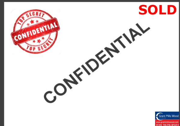
Confidential West London Multi Let, Industrial Estate In Excess of 100,000 sq ft