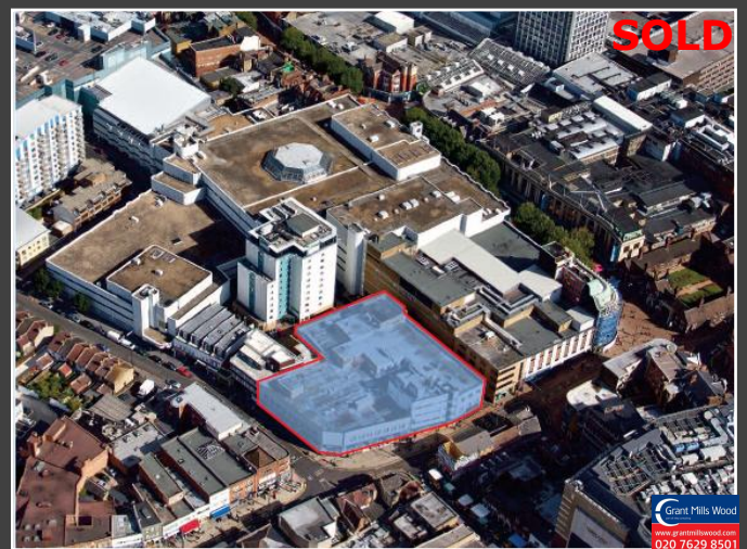
12-20 Crown Hill, Croydon, CR0 1RZ 53,500 sq ft- Investment /Development Opportunity