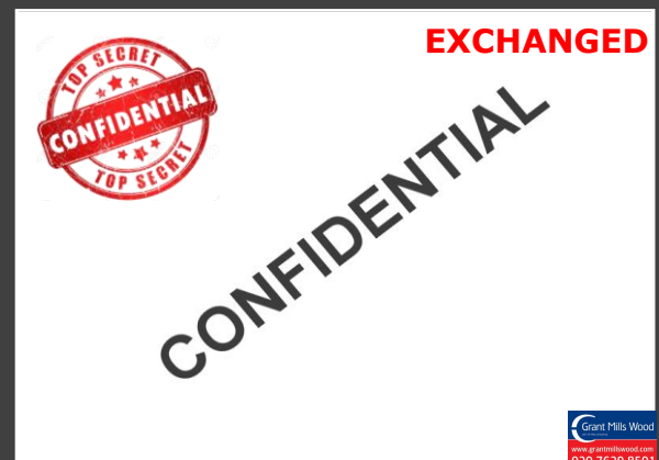
Confidential North West London Multi Let, Industrial Estate +1Acre