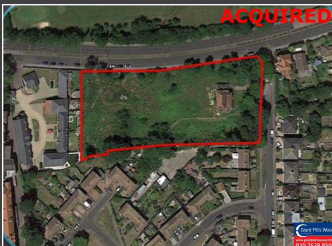
Hundreds Farm, Canterbury Road, Westgate-On-Sea, Kent, ST8 8LU 1.68 Acre Site