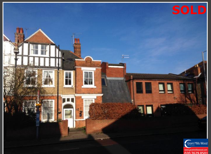
11 Lingfield Avenue, Kingston-Upon-Thames, Surrey, KT1 2TL 0.27 Acre Site