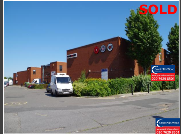
Heron Trading Estate, Alliance Road, West Acton, London, W3 Multi Let – 6 Units - Approx 25,000 sq ft