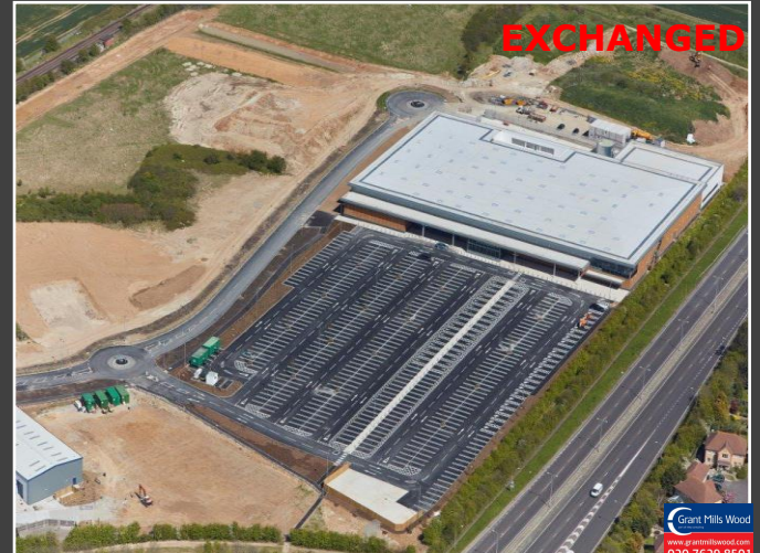
Altira Park, Margate Road, Herne Bay, Kent CT6 6LA 6.97 Acre Site- Required for 100,000 sq ft food store