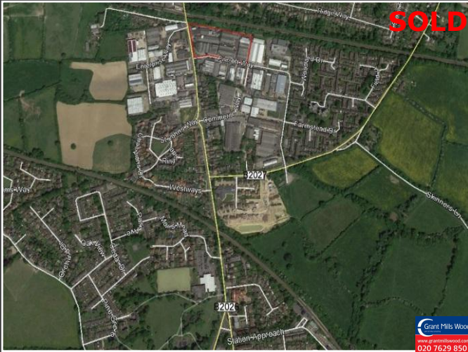
Edenbridge, Fircroft Road, Edenbridge 5.1 Acre Site