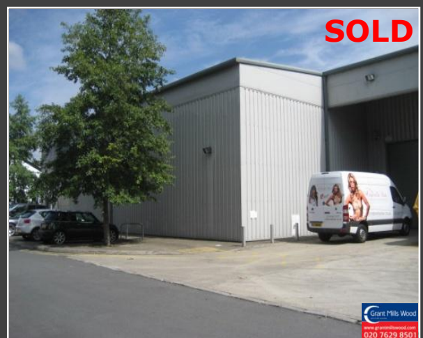
Unit A, Sunbeam Centre, Park Royal, NW10 9.006 sa ft