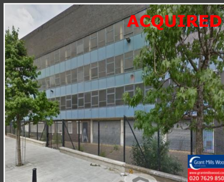
3 Crown Close, Hackney Wick, London E3 2JQ 21,086 sq ft