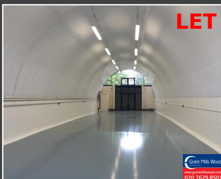
Arches 655-656 Portslade Place, Wandsworth Road, London, SW8 3DH 2,200-4,450 sq ft