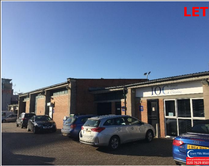
Units 9, 10, 13, 14, 18 and 23 Highway Business Park, Heckford Street, Tower Hamlets, London, E1W 3HS 820- 3,500 sq ft