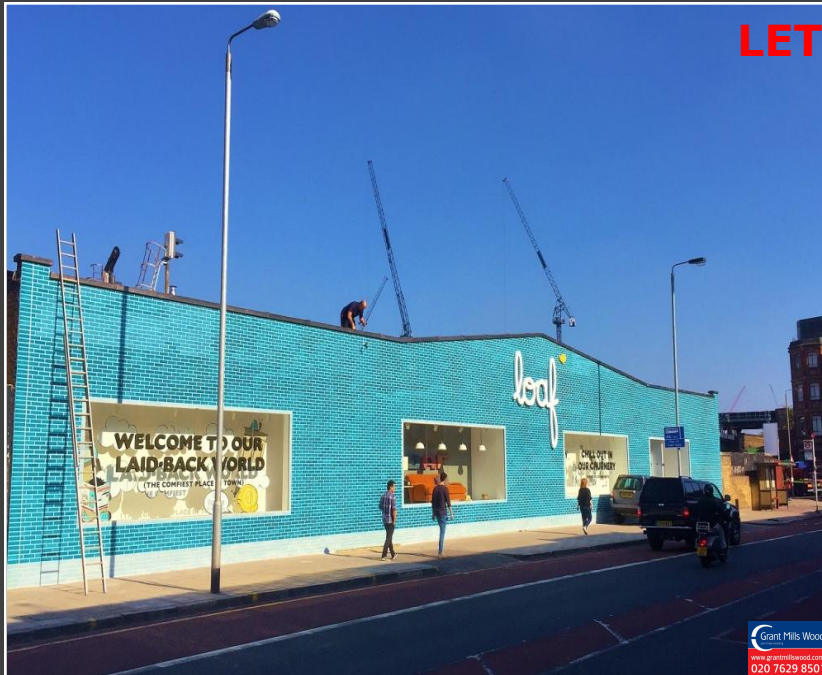
Arches 11-20, Queenstown Road, Battersea, London, SW8 3NP 8,244 sq ft

As we have recently launched our new website , we thought it was a good time for a market update. We have included details for an assortment of Leasehold and Freehold deals we have recent been involved with. If you require more information or for a nosey... please go to our Deals Done page or contact the GMW team .