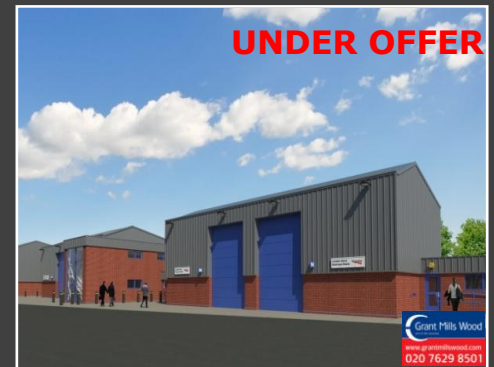
I & J and M & N London Stone Industrial Estate, Battersea, SW8 3QR 1,259 to 10,213 sq ft