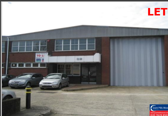
Unit 38 Westwood Park, Concord Road, West Acton, London, W3 0TH 6,824 sq ft