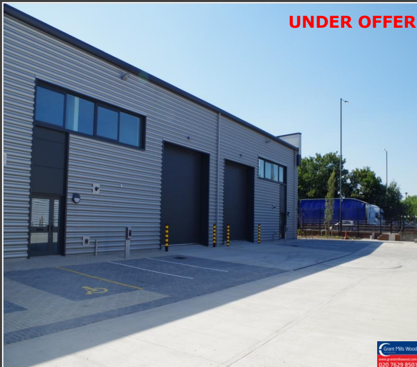
Units 4, 5, 6 and 7 Wembley Trade Park, 390 North Circular Road, Wembley, London, NW10 0JF 4,348 -11,106 sq ft