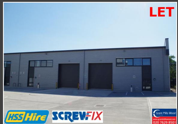
Units 8 and 9, Wembley Trade Park, 390 North Circular Road, London, NW10 0JF 2,723 to 5,747 sq ft