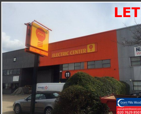
Unit 11, 1000 North Circular Road, London, NW2 7JP 5,254 sq ft