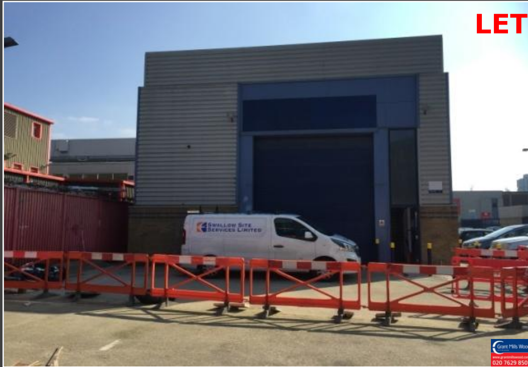
Units 6 and 17 Linford Street. Battersea, London, SW8 4UN 3,462 and 3,492 sq ft