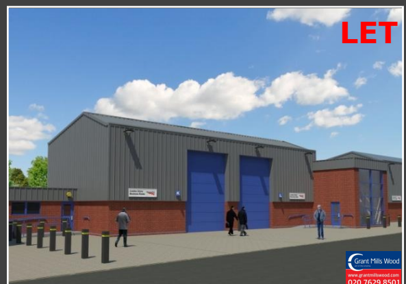
K & L London Stone Industrial Estate, Battersea, SW8 3QR 3,573 sq ft