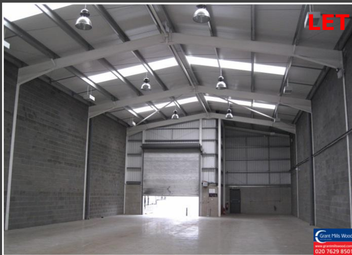
5 Gorst Road, Park Royal, London, NW10 6LA 6,426 sq ft