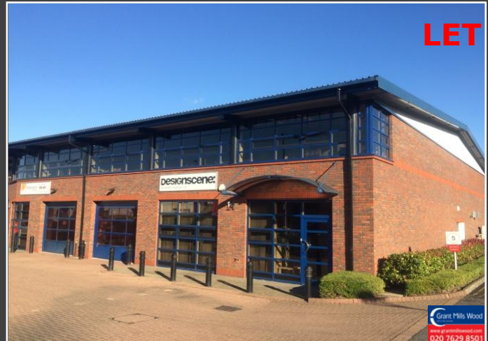
Unit 14 and 23 Alliance Court, Alliance Road, West Acton, London, W3 0RB 2,496 and 2,995 sq ft