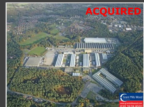
Building 74 - Whitehill & Bordon Enterprise Park, Prince Philip Barracks, Bordon, GU35 0JE 3 Acres