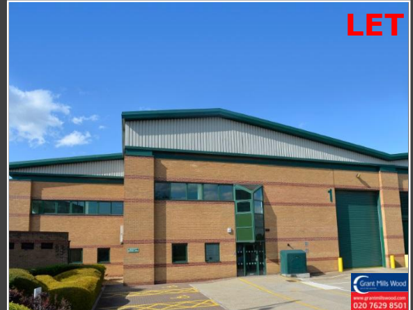
Unit 1 Falcon Park, Neasden Lane, London, NW10 1RZ 12,570 sq ft