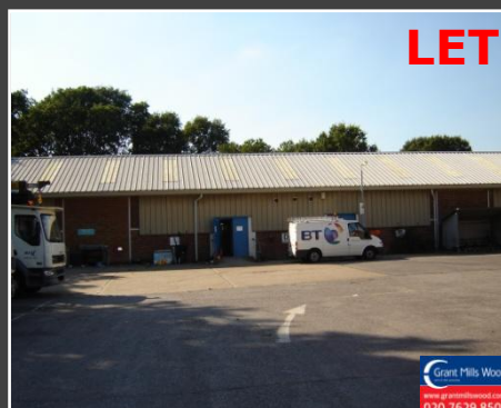
Former BT Building, Cox Lane, Chessington, KT9 1TX 10,900 sq ft