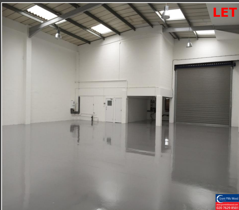
Unit 34 Capitol Park, Capitol Way, Colindale, London, NW9 0EQ 5,113 sq ft