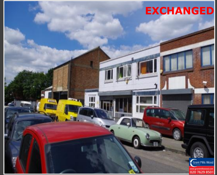
52 Gorst Road, Park Royal, London, NW10 6LD 6, 426 sq ft