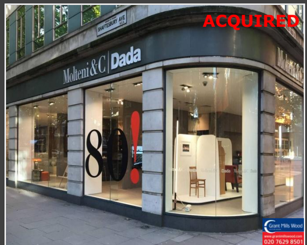
179-199 Shaftsbury Avenue, Covent Garden, WC1 3,815 sq ft