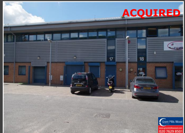
Unit 17 Oliver Business Park, NW10 7JB 1,905 sq ft