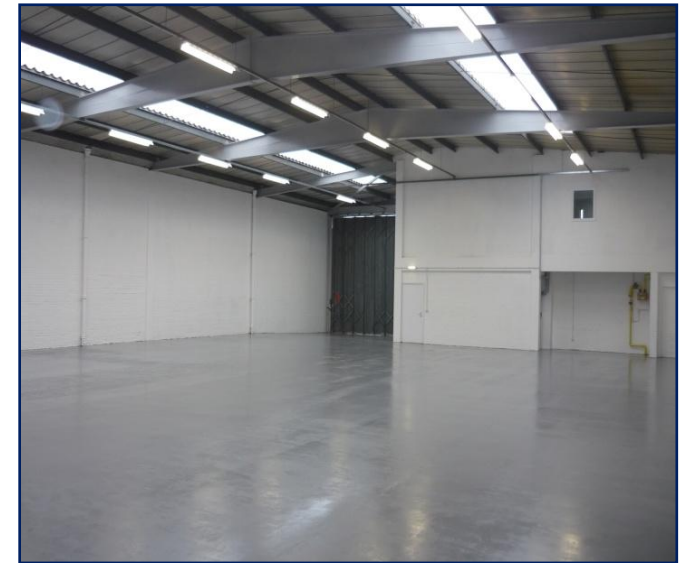
Indicative image of a refurbished unit on the estate.

An EPC has been requested. Please contact the agent for further details